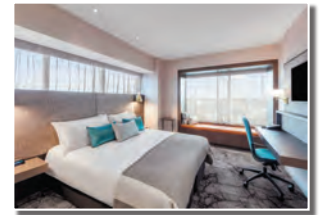
Superior King Room $280 per night